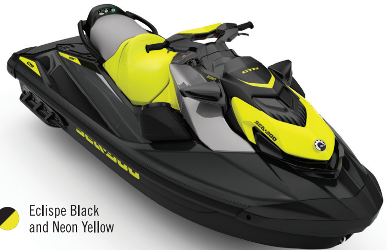
Eclipse Black and Neon Yellow