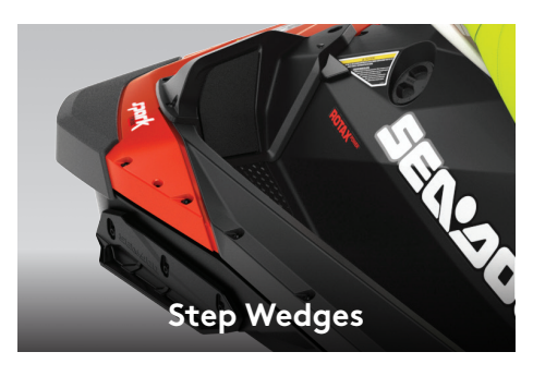
Provides enhanced stability and confidence in different riding positions making it easier to pull off