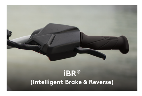
Exclusive to Sea-Doo®, iBR® stops the watercraft sooner and provides more control and maneuverability at low speeds and in reverse.