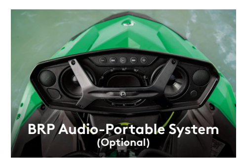
High-quality, waterproof 50-watt Bluetooth<sup>‡</sup> portable sound system.