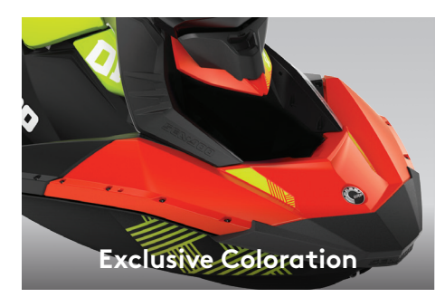
Exclusive TRIXX<sup>™</sup> coloration.