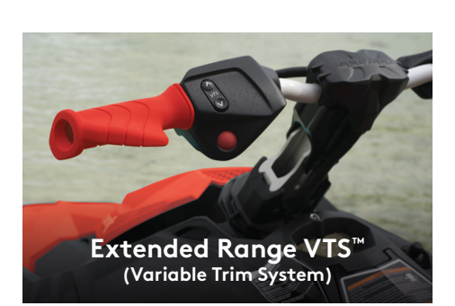
Offers double the range of the regular VTS<sup>™</sup> for easier and more exaggerated tricks.