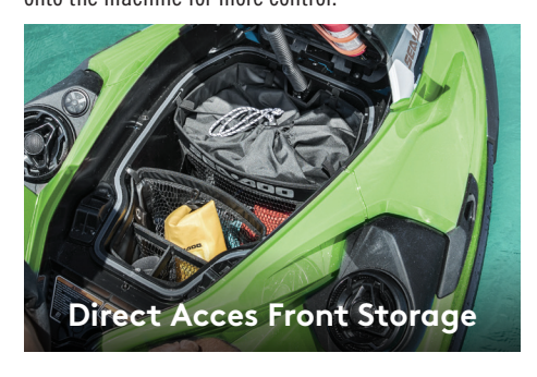
Large front storage area that's easily accessible from a seated position.1