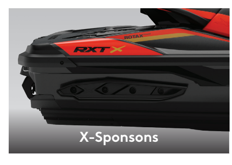
Race-inspired X-Sponsons for increased turning performance.