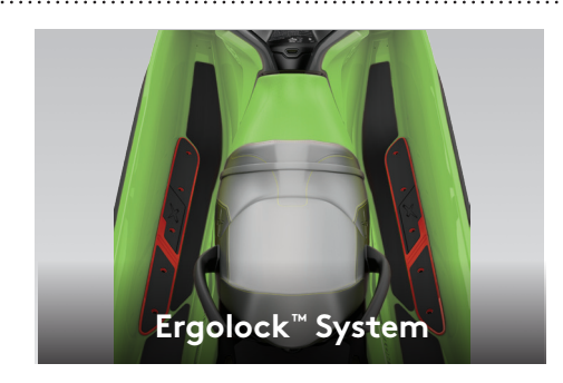
A narrow seat profile with deep knee pockets lets riders sit naturally and use the leg muscles to hold onto the machine for more control.