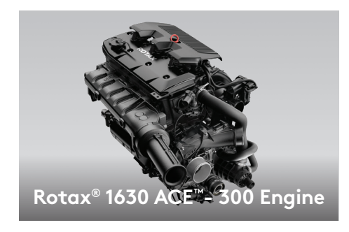
The Rotax® 1630 ACE<sup>™</sup>- 300 is the most powerful Rotax® engine ever, delivering high efficiency and the best-in-class acceleration.