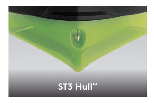
An innovative hull that sets the benchmark for rough water handling, stability, and offshore performance.